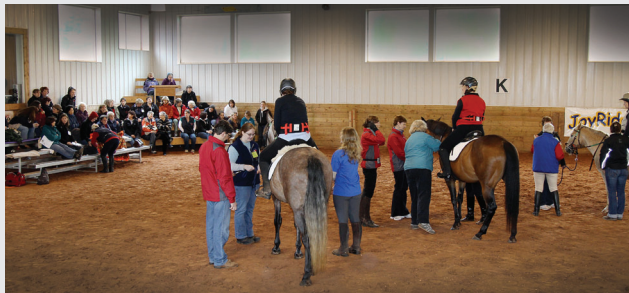
An interactive clinic at the 2011 Conference in P.E.I.

Find general information, conference schedule, speaker biographies, accommodations and travel information, as well as registration rates and forms, on our website www.cantra.ca under News & Info.