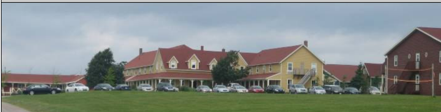
Stanhope Bay and Beach Resort, Stanhope, PEI — Conference Hotel

Planning continues for CanTRA’s next National Conference – “Basics and Beyond” . Conference organizers are recruiting speakers who will be of interest to multiple groups of individuals involved in providing therapeutic riding services across the country. To achieve this, the conference committee is putting together a ‘partial’ two-track conference so that separate sessions can be offered to riding instructors and other therapeutic personnel including topics such as fundraising, donor cultivation and retention and volunteer recruitment, training and retention.