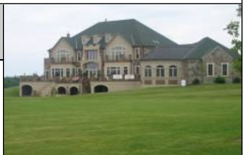
Conference Site — The Main House

There will be something for everyone, so we hope to see you there!