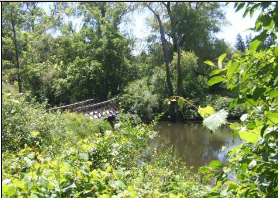
The grounds at Ignatius College Farm

There will also be two presenters who will bring fun to the retreat to help you “re-charge your batteries” and return to your centre with renewed energy.