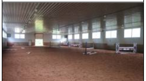
Conference Site — Indoor Arena