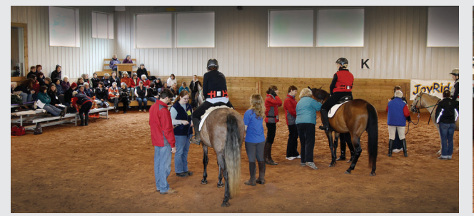
An interactive clinic at the 2011 Conference in P.E.I

Find general information, conference schedule, speaker biographies, accommodations and travel information, as well as registration rates and forms, on our website www.cantra.ca under News & Info.