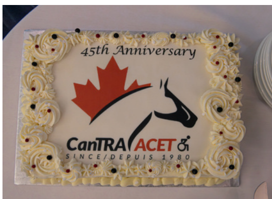
CanTRA 45th Anniversary Cake